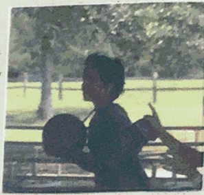
Generosity or Happy Time